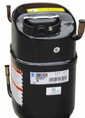
France Tecumseh compressor